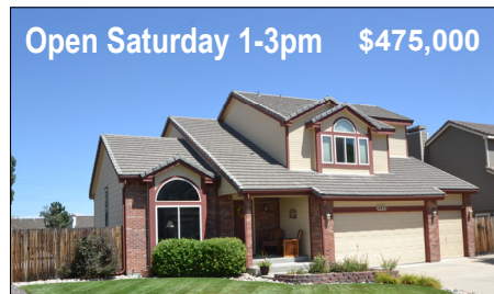
Open Saturday 1-3pm $475,000

This home at 11833 W. 56th Circle is located in the Valley at Rainbow Ridge adjoining the Van Bibber open space park, just east of Ward Road in Arvada. You can access the bike/pedestrian trails of the park near this home. In addition, this home backs to a pond with a trail around it, located in the middle of the subdivision. The house itself has 4 bedrooms and 3½ baths and 3,399 square feet of interior space, including a finished walk-out basement. The updated kitchen has granite countertops and stainless steel appliances. Other features include hardwood floors and a study with French doors. In addition to the oversized 3-car garage, there's RV parking with power. You'll enjoy entertaining on the wood deck plus a patio with included gazebo overlooking the pond. All bathrooms have been updated. To fully appreciate this home, view the video tour at www.RainbowRidgeHome.com , then call your agent or me at 303-525-1851 for a showing, if you can't come to Saturday's open house. Note: Buyer gets free use of Golden Real Estate's moving truck and free moving boxes!