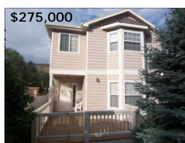
Take a VIDEO Tour online at: www.171WashingtonAve.com

The seller's good fortune can now be yours. He's a Mines professor who won a coveted professorship in Switzerland and is now making his 3-bedroom, 3-bath townhome in Golden proper available for you! Enjoy the proximity to Clear Creek, downtown Golden, hiking trails and Mitchell Elementary School in this beautifully staged and easy to show listing.