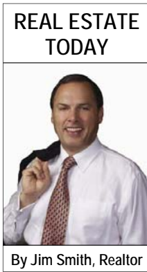
By Jim Smith, Realtor

To answer that question, I analyzed the 2006 vs. 2005 statistics for Jefferson County by individual MLS area, as shown on the map at