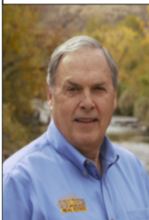
By JIM SMITH, Realtor®

Just give us your address and the boundaries of the area you wish to monitor. The initial alert will tell you all the active, under contract, sold, withdrawn and expired listings in that area, going back 90 or 180 days or longer. Future alerts will come to you within 15 minutes of a new or changed listing being entered on the MLS. You will literally be up-to-the-minute in your knowledge of real estate activity in your neighborhood!